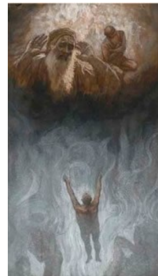
James Tissot, The Rich Man Pleads with Abraham, ca 1890

September 29 th 2019 – 26 th Sunday in Ordinary Time (Year C)