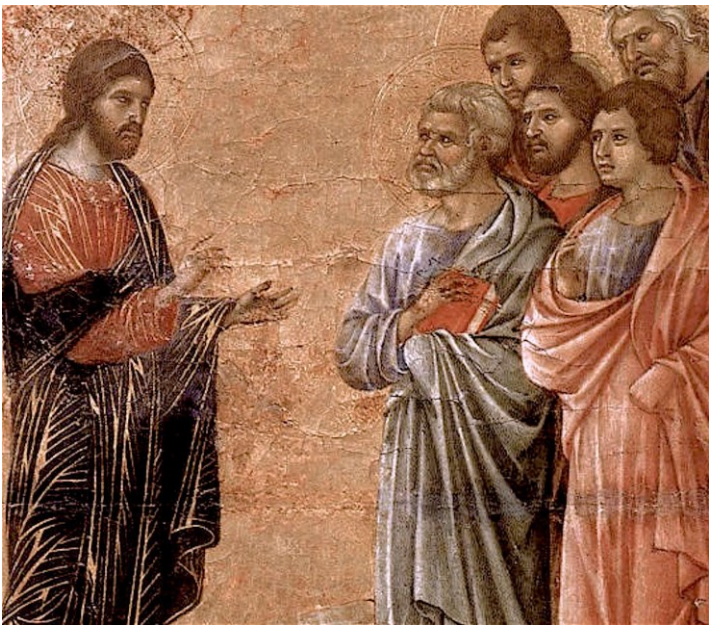
Duccio di Buoninsegna, detail Between 1308 and 1311 Appearance on the Mountain in Galilee